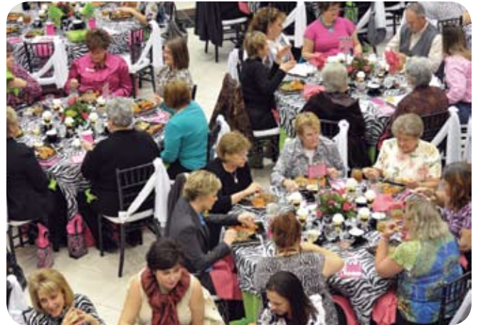
Attendees enjoyed the safari-themed atmosphere.

A fter two years of success, Weatherford Regional Medical Center's (WRMC) Healthy Woman program is 2,700 members strong and continues to help women stay healthy. The anniversary celebration was a recipe for a wild night. The event featured a women's expo and health fair offering free screenings, health information and demonstrations, partner exhibits and door prizes. The celebration brought nearly 300 women together to improve mind, body and spirit.